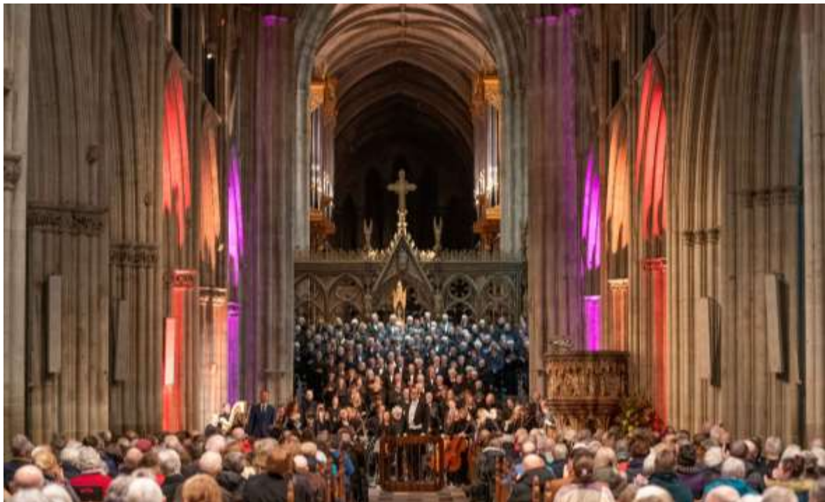
Ein Deutsches Requiem November 2023